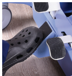
Foot push pad helps initiate forward momentum when loaded