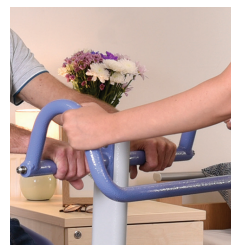
Contoured, multi-point push handle and patient hand-hold bar