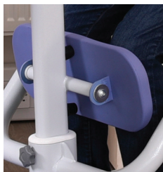
Soft moulded knee pad for comfort